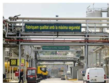
The factor premises of Croda Ibérica SA at the Fogars de la Selva site (Barcelona).

The VEGAPULS 64 level sensor launched onto the market last year is also in use at the site and demonstrates its advantages in the measurement of a mixture of special detergent recipes and alcohols. Here, the sensors measure the raw material supplies in three tanks with heights of two, three and five metres. The result of the measurement is decisive for the further processes because the end product of this raw material accounts for about a quarter of the whole production at the factory. Because the level sensor VEGAPULS 64 measures without contact with the help of radar technology, there are automatically fewer problems with product deposits and the radar measuring technology is also ideal from a hygiene point of view. The front-flush, encapsulated antenna, for example, can be cleaned optimally and is insensitive to the extreme conditions of the SIP and CIP processes.