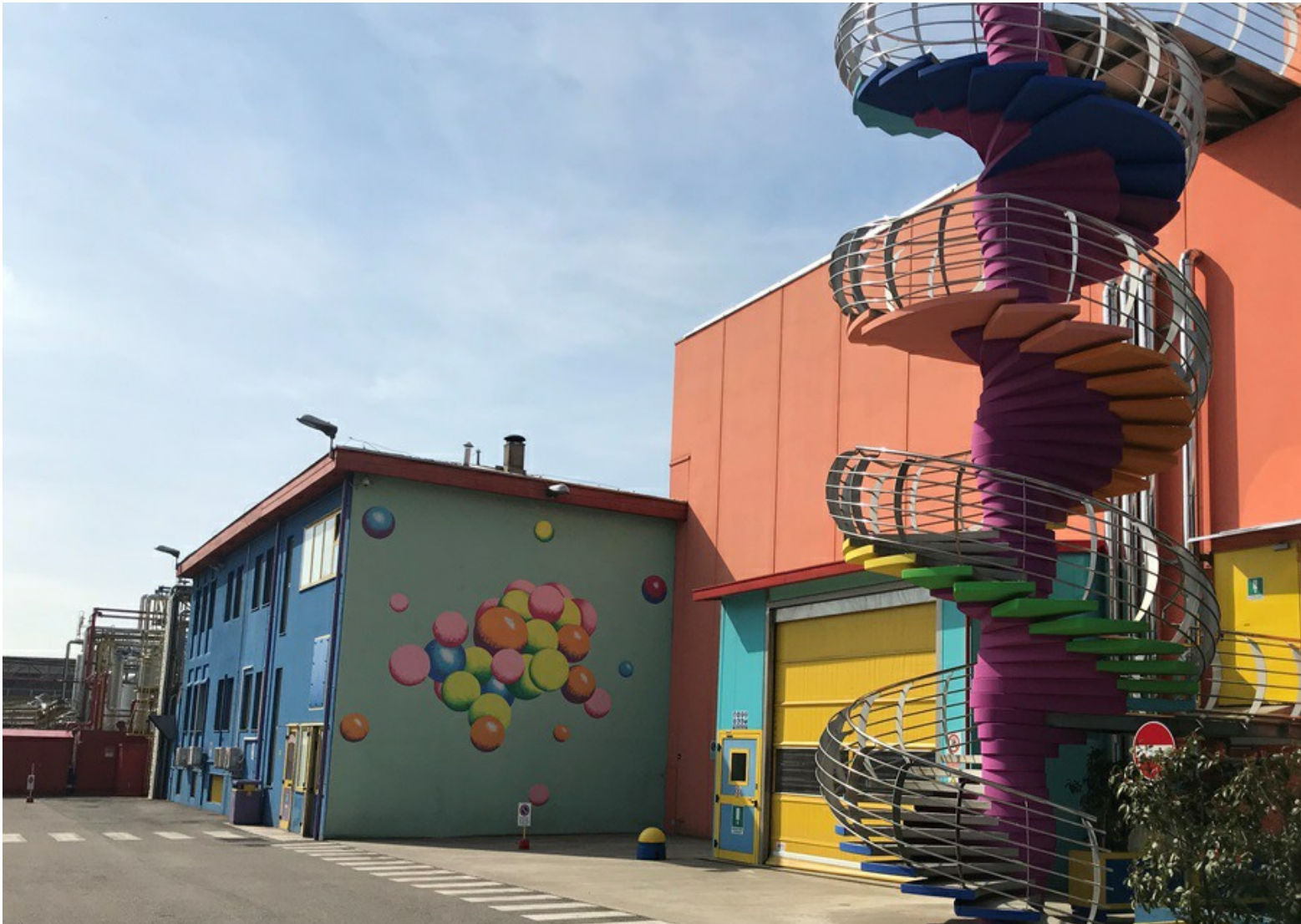
ACS Dobfar produces high-quality pharmaceutical intermediates, active pharmaceutical ingredients (APIs) and ready-to-use medicinal products.