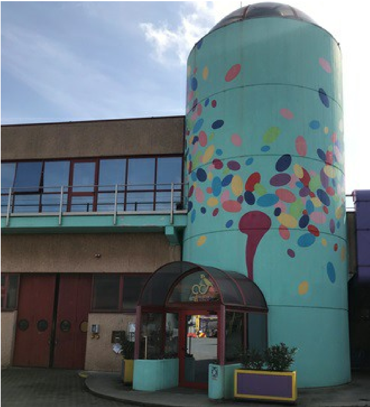
Headquarters of ACS Dobfar in Tribiano near Milan.