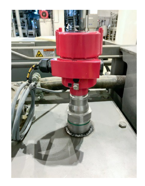
Notice that these VEGA sensors are not yellow, but the typical Progroup red.

In August 2018, the Progroup engineering team installed the VEGA sensors themselves and, thanks to the familiar plics® adjustment concept, commissioned them without any problems. As usual, the display and adjustment module PLICSCOM is used for setting up and commissioning the plics® sensors as well as displaying the measured values on site. A PC or a special software is not required. The display and adjustment module can be inserted into the sensor and removed again without having to interrupt the power supply. The new optional Bluetooth feature allows the sensor to be adjusted wirelessly from a distance of approx. 50 meters. Since no additional fittings or special connectors were needed to install the instrument, the installation and commissioning costs were also minimal. The most important advantage, however, is certainly that, thanks to continuous level detection, any leaks can now be detected and remedied in time to avoid shutting down the paper machine.