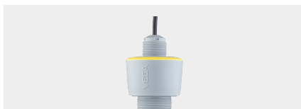
VEGAPULS C 11