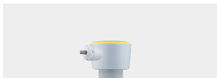
VEGAPULS C 22