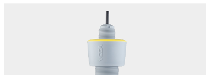
VEGAPULS C 21