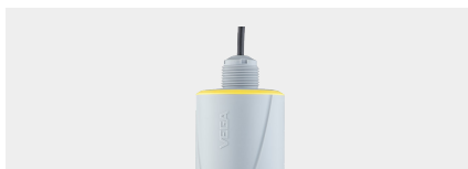
VEGAPULS C 23