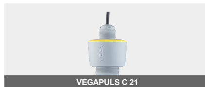
VEGAPULS C 21