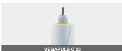
VEGAPULS C 23