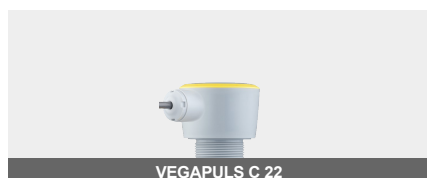
VEGAPULS C 22