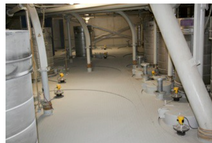
Every silo now has a VEGAPULS 69 that replaced the existing silo weighing system.

Almost all the sensors worked reliably right from the start and delivered accurate readings. Since VEGA instruments indicate filling percentages, a program converts these values into tonnages. The inventory management system administers these results and provides additional data security. The only silo that gave the technicians some headaches was the one holding raw materials with extremely low bulk density. Such materials are very difficult to measure and up to that point no sensor had worked reliably. One of the problems, for example, are the welding seams of silos, which generate false echoes. Even the echo curves of empty silos are extremely complex. "Together with VEGA we positioned the sensor differently and changed its orientation. We also adjusted the parameters again. Since then, this measuring point works perfectly."