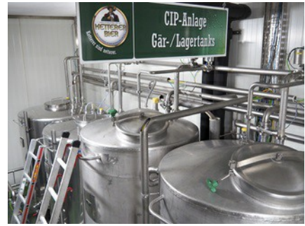
Additional pressure transmitters are used in the CIP tank.

It's been more than 20 years since the company first became aware of VEGA. That was when a level measuring system was installed on a spent grain silo. Over the years, step by step, new measuring points have been added. More than anything else, the demand for increasing hygienic process requirements were the catalyst for the upgrading and extension of measuring equipment in the brewery. All the fermentation and storage tanks were rebuilt, one after the other, to enable them to be cleaned better. Today, VEGA sensors are used in many places across the plant, e.g. in the CIP systems, in the brewing water tanks, in the storage tanks as well as in the fermentation tanks in the brewhouse. The sensors serve as overflow protection, support precise inventory measurement and take over the dosing of mixed beverages as well as the entire process control. Vogt especially appreciates their close proximity to the VEGA factory.