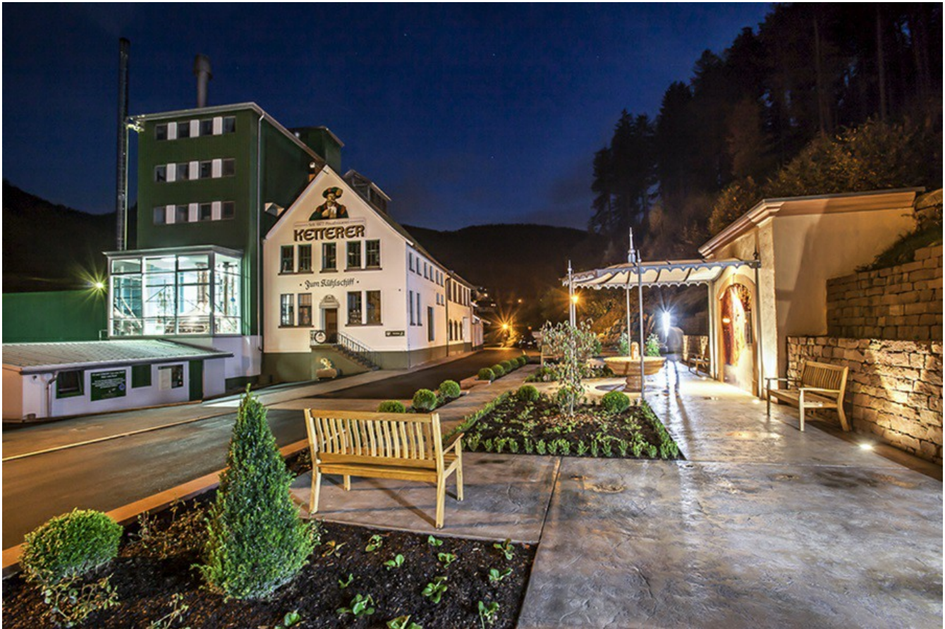
Front façade of the Ketterer brewery in Hornberg.

"We still use tanks that do not have any level measuring system, as not every tank can be retrofitted with instrumentation. But what is certain is that all the new tanks will be – and with radar level transmitters from VEGA."