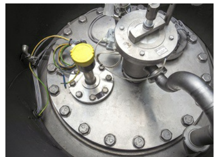
A VEGAPULS 64 radar level transmitter performs contents measurement.

During the last plant modification, a new buffer tank for mineral water was installed. Here too, a VEGAPULS 64 took over the task of inventory control. Since the water used for brewing is largely responsible for the quality and taste of the beer, the Hornberg brewers have always given it special attention. Many years ago they discovered a new spring in a buried tunnel in the forest above Hornberg. This particularly soft water turned out to be of such high quality that it is now marketed all over Germany as a brand of its own, called "Hornberger Lebensquell" ("Life Source"). In the meantime this spring water has become a second sales mainstay for the family brewery.