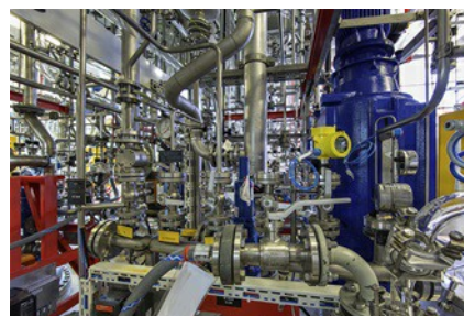
Concentration changes of the reacting solutions take place in milliseconds in many pharmaceutical processes.

The especially wide measuring range of VEGABAR 82 pressure transmitters was decisive in CARBOGEN AMCIS AG's decision to establish as them as the standard. This versatile sensor with the oil-free, ceramic CERTEC® measuring cell can handle two thirds of all conceivable applications in the process industry. A single sensor has replaced the sensor pairs that were previously required on a number of process apparatuses at CARBOGEN AMCIS AG. The previous measurement solution covered the required measuring range only by means of two sensors installed next to each other. This involved more material, "which caused a lot of unnecessary work," says Kaiser, summing up the earlier situation.