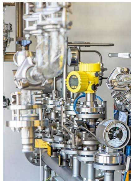
Ensuring simplified qualification: CARBOGEN AMCIS AG uses mostly identical, standardized pressure transmitters.