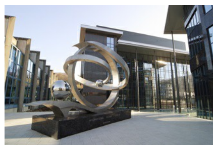
Headquarters of CARBOGEN AMCIS AG in Bubendorf, Switzerland.

The demand for personalized medicines and seamlessly quality validation is increasing. Drivers of the needed innovations are often the smaller, research-oriented companies that make their processes and approval procedures flexible and reduce both effort and costs through standardization. A good example of this can be found at CARBOGEN AMCIS AG, where VEGABAR Series 80 is used for pressure measurement. Thanks to their wide measuring range and ceramic CERTEC® measuring cell, these high-performance pressure transmitters meet the requirements of bioprocesses, from fermentation and filtration to purification.