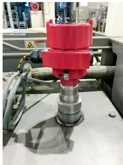
Notice that these VEGA sensors are not yellow, but the typical Progroup red.

In August 2018, the Progroup engineering team installed the VEGA sensors themselves and, thanks to the familiar plics® adjustment concept, commissioned them without any problems. As usual, the display and adjustment module PLICSCOM is used for setting up and commissioning the plics® sensors as well as displaying the measured values on site. A PC or a special software is not required. The display and adjustment module can be inserted into the sensor and removed again without having to interrupt the power supply. The new optional Bluetooth feature allows the sensor to be adjusted wirelessly from a distance of approx. 50 meters. Since no additional fittings or special connectors were needed to install the instrument, the installation and commissioning costs were also minimal. The most important advantage, however, is certainly that, thanks to continuous level detection, any leaks can now be detected and remedied in time to avoid shutting down the paper machine.