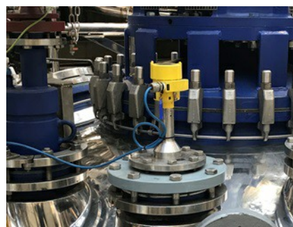
VEGA sensors have been an integral part of production at ACS Dobfar for more than ten years.

Pressure transmitters are also deployed in many places in this Italian plant, for example in the feed lines that transport finished products to the storage tanks. The VEGABAR 82 , for example, is used to both control production processes and monitor nitrogen neutralization. In some process areas, the VEGABAR 82 – with its ceramic diaphragm – is used in combination with PVDF process fittings and FFKM seals where highly aggressive substances are involved. The measurement applications range anywhere from vacuum to an overpressure up to 15 bar.