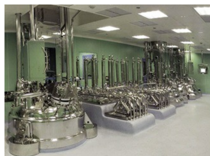
Level sensors monitor and control widely different product quantities.

On the main storage tanks, which have a height of 8 to 15 m and a diameter of approximately 2 to 3 m, a whole series of level sensors from VEGA are installed. There they monitor and control a wide variety of products. Besides raw materials, solvents and acids are also stored in the tanks. "We place a number of different requirements on the instruments at the same time. First and foremost, all the sensors we install must have ATEX approval. We also recently began to standardize our pressure transmitters according to SIL," explains Brucoli further.