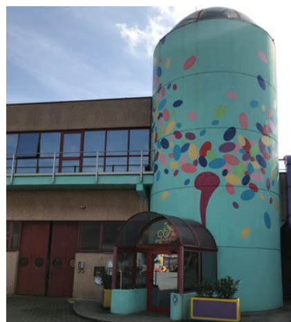
Headquarters of ACS Dobfar in Tribiano near Milan.

The manufacturing processes are extremely complex. For that reason, numerous sensors are required to monitor production. In the storage tanks and reactors, it is mainly parameters such as level and pressure that are of interest. The company became aware of VEGA through the positive feedback coming in from the market. Today more than ever, people are convinced of the high quality of VEGA process instrumentation. For its new production facilities, ACS Dobfar chose to use sensors from VEGA and is gradually replacing older instruments with them. "We're using mainly VEGAPULS non-contact radar and VEGAFLEX guide wave radar level sensors on our raw material and waste water tanks. And since the market launch of VEGAPULS 64 non-contact radar in 2016, we've been using it more and more in our reactors," explains Lino Brucoli – the person responsible for plant automation at ACS Dobfar – pointing out the main areas of application for radar level sensors.