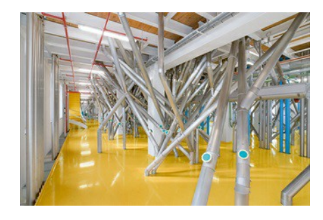
The piping network conveys the intermediate products to the roller mills. Every process step is comprehensively monitored during operation.

Levels are measured everywhere in the plant. Many different types of measuring instruments are employed for this. For example, there are 137 VEGACAP 63 capacitive probes in the wheat receiving station. However, level sensors are also used in the production of animal feed for process control. When the product is being pelletized, the pre-depot always has to be completely filled to ensure that the density of the pellets is correct. For that reason, an especially reliable measuring signal is required in the overflow cell in the pelletizing process, since further cells may or may not be opened, depending on the filling level. If the cell overflows, the dosing units shut down. Ultimately, if the situation is not rectified, even the mills are switched off. That means that the process planners need a 100 % accurate signal, otherwise the entire production plan can run off course.