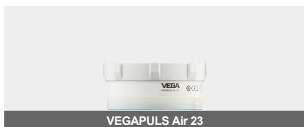
VEGAPULS Air 23