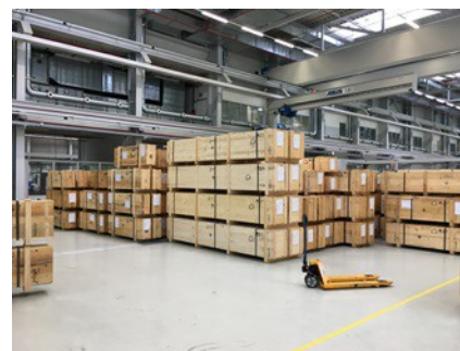
The large order for Linde reached enormous proportions.

Interestingly, not one of the 350 instruments is exactly the same as another in design. In petrochemical plant engineering, all customer requirements have to be fulfilled. Right down to the smallest detail. Almost 300 of the 350 VEGAFLEX 81 and 86 sensors were manufactured as a complete system in a bypass chamber – already assembled, mounted and ready for operation. Approximately 30 additional sensors as special versions will be used in high-pressure steam boilers.