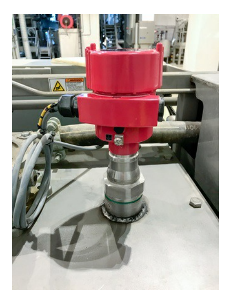
Notice that these VEGA sensors are not yellow, but the typical Progroup red.

In August 2018, the Progroup engineering team installed the VEGA sensors themselves and, thanks to the familiar plics® adjustment concept, commissioned them without any problems. As usual, the display and adjustment module PLICSCOM is used for setting up and commissioning the plics® sensors as well as displaying the measured values on site. A PC or a special software is not required. The display and adjustment module can be inserted into the sensor and removed again without having to interrupt the power supply. The new optional Bluetooth feature allows the sensor to be adjusted wirelessly from a distance of approx. 50 meters. Since no additional fittings or special connectors were needed to install the instrument, the installation and commissioning costs were also minimal. The most important advantage, however, is certainly that, thanks to continuous level detection, any leaks can now be detected and remedied in time to avoid shutting down the paper machine.