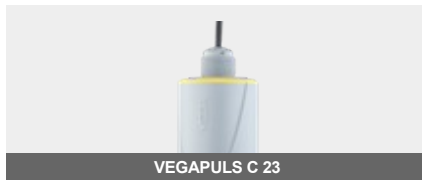
VEGAPULS C 23