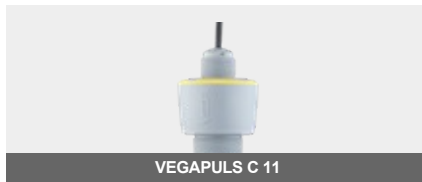
VEGAPULS C 11