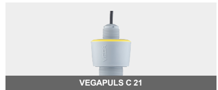
VEGAPULS C 21