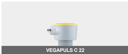
VEGAPULS C 22