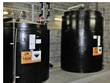
Chemical tanks for storing acids and alkalis.

With its large selection of process fittings, VEGAPULS 64 is suitable for a wide variety of applications in the chemical industry.