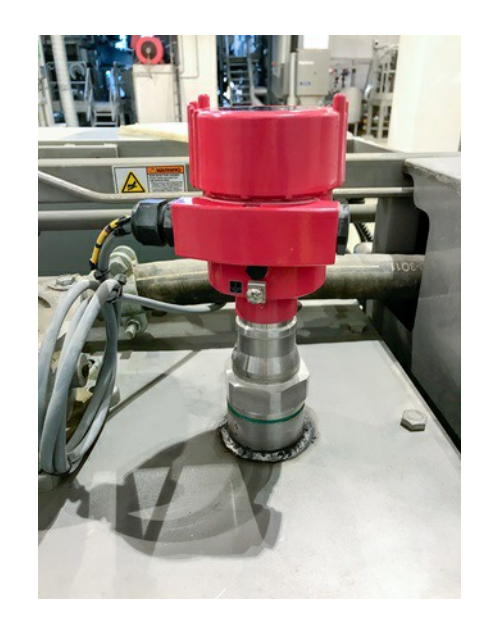
Notice that these VEGA sensors are not yellow, but the typical Progroup red.

In August 2018, the Progroup engineering team installed the VEGA sensors themselves and, thanks to the familiar plics® adjustment concept, commissioned them without any problems. As usual, the display and adjustment module PLICSCOM is used for setting up and commissioning the plics® sensors as well as displaying the measured values on site. A PC or a special software is not required. The display and adjustment module can be inserted into the sensor and removed again without having to interrupt the power supply. The new optional Bluetooth feature allows the sensor to be adjusted wirelessly from a distance of approx. 50 meters. Since no additional fittings or special connectors were needed to install the instrument, the installation and commissioning costs were also minimal. The most important advantage, however, is certainly that, thanks to continuous level detection, any leaks can now be detected and remedied in time to avoid shutting down the paper machine.