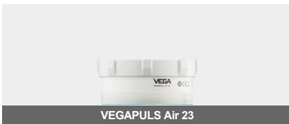
VEGAPULS Air 23