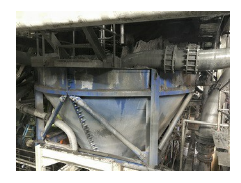
Extremely rough conditions prevail in diamond mines. Dust and dirt, ever present in the ore processing facilities, are a real challenge for level measurement technology.

An older radar sensor with a transmission frequency of 26 GHz, which was installed there a few years ago, always had problems. Accumulation of dust and debris caused build-up on the antenna, which resulted in false readings again and again. Although radar technology is a non-contact measuring method and therefore ideal for dirty environments, the sensor no longer worked optimally because of these extreme ambient conditions.