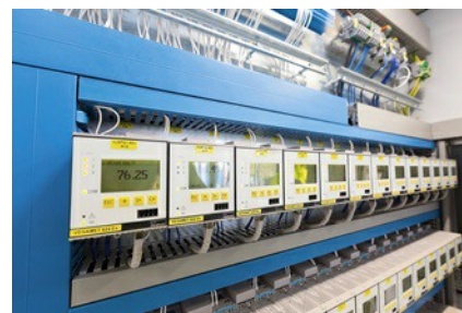
Control cabinet with VEGAMET 624 controllers for the underground solvent storage facility.

Thanks to VEGA Inventory System, those responsible for logistics and technology in the company become essentially system administrators: They can easily integrate additional locations into the system and also grant access rights to Brenntag customers. Level data recording over a longer period of time allows an assessment of business development up to the present and thus a forecast for the future. The automated flow of information with its digital transparency offers long-term advantages for the entire supply chain: early information for the supplier and security of supply for the customer.