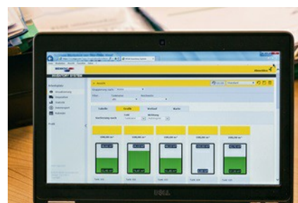
Inventory management with VEGA Inventory System.