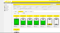
VEGA Inventory System - VEGA Hosting