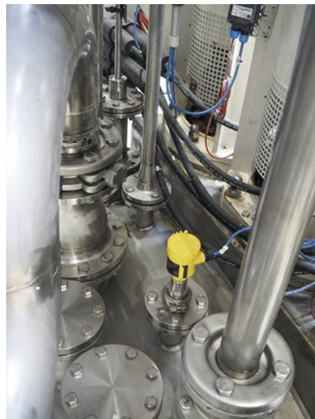
The radar level transmitter VEGAPULS 64 measures the levels in the production equipment with reliability and accuracy.

Now, the sensor can measure and follow the level perfectly even when the agitators are switched on.