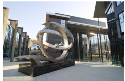
Headquarters of CARBOGEN AMCIS AG in Bubendorf, Switzerland.

The demand for personalized medicines and seamlessly quality validation is increasing. Drivers of the needed innovations are often the smaller, research-oriented companies that make their processes and approval procedures flexible and reduce both effort and costs through standardization. A good example of this can be found at CARBOGEN AMCIS AG, where VEGABAR Series 80 is used for pressure measurement. Thanks to their wide measuring range and ceramic CERTEC® measuring cell, these high-performance pressure transmitters meet the requirements of bioprocesses, from fermentation and filtration to purification.