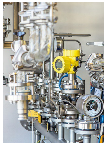
Ensuring simplified qualification: CARBOGEN AMCIS AG uses mostly identical, standardized pressure transmitters.