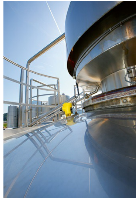
VEGAPULS 64 measures the level reliably in the whey tanks.

In the past, many tanks were equipped with level measuring systems, but these were usually delivered within the framework of a complete contract. In practice, this did not always prove to be particularly successful as the equipment suppliers were not level measurement specialists. A differential pressure system with sensors near the tank bottom was often supplied as standard equipment. From a maintenance point of view this was very labour intensive, as Schneider reports. "During the cleaning of the whey tanks, for example, mechanical damage to the diaphragm in the pressure transducers would occur again and again when a wrench fell into the tank." Another situation: the tanks are meticulously inspected at regular intervals. To do this, the milk technician has to climb into the tanks to inspect them from the inside. Again, there was a risk that the pressure transducers attached to the base could be damaged during each inspection.