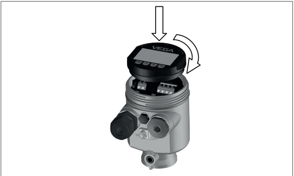
Fig. 1: Installing the display and adjustment module in the electronics compartment of the single chamber housing

Make sure that the intrinsically safe display and adjustment module PLICSCOM which was operated on non-intrinsically safe circuits is no longer used in intrinsically safe instrument.